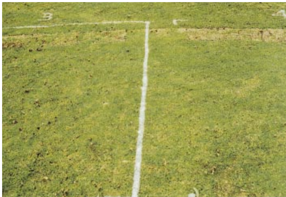
By mid March, it became noticeable that bird damage was still occurring in all of the control plots (left, plot 3). In stark contrast to this were the treated plots where no evidence of bird damage was observed (right, plot 4)

After four days, an informal inspection showed dead larvae in the ENs' plots. A formal inspection was made 14 days after treatment that involved removing sections of turf and soil from each plot measuring two metres by 300mm by 100 mm deep. Live and dead larvae and pupae were then counted. Both rates of nematodes killed 50 per cent of insects counted and after the initial count only Treatment 2 (the low nematode rate) and the control were assessed. One week later, 75 per cent of insects counted had been killed in